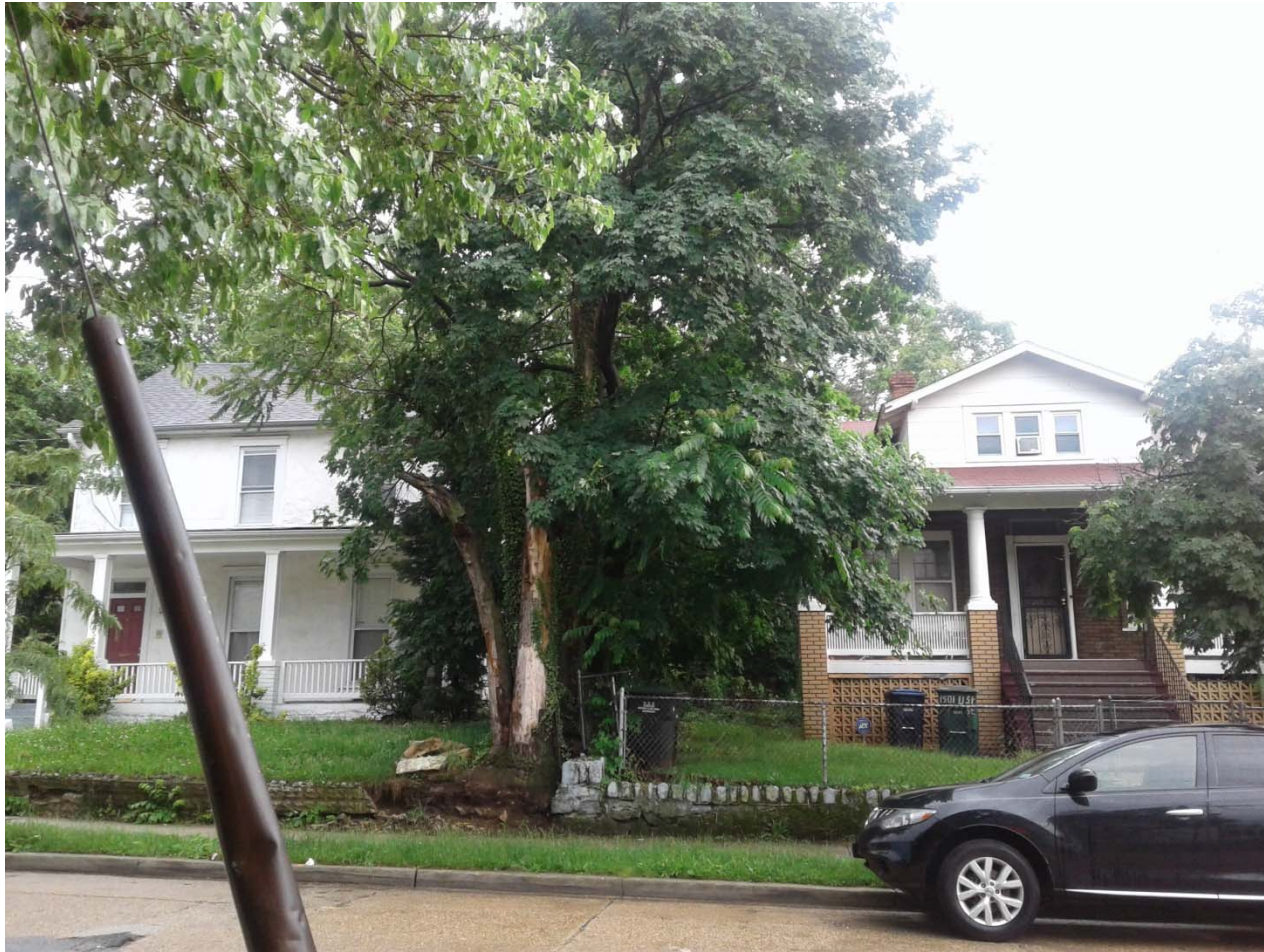
Analysis of Side Yards 1900 Block 15th Street and U Street SE by Dorcas Agyei, May 2018