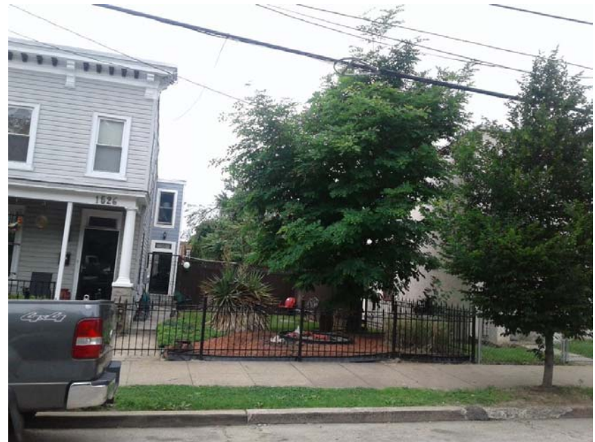
Analysis of Side Yards 1900 Block 15th Street and U Street SE by Dorcas Agyei, May 2018