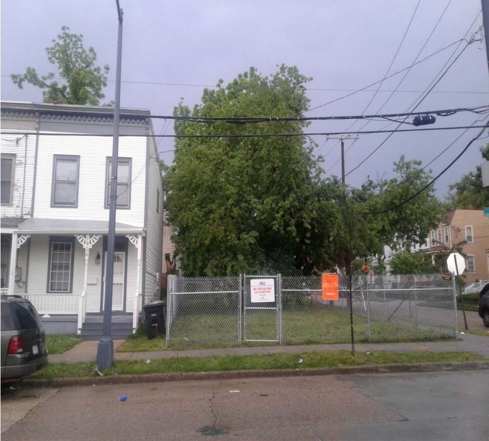
Analysis of Side Yards 1900 Block 15th Street and U Street SE by Dorcas Agyei, May 2018