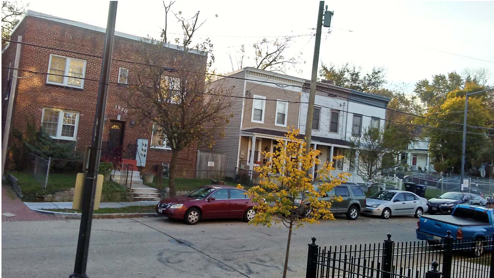
Analysis of Side Yards 1900 Block 15th Street and U Street SE by Dorcas Agyei, May 2018