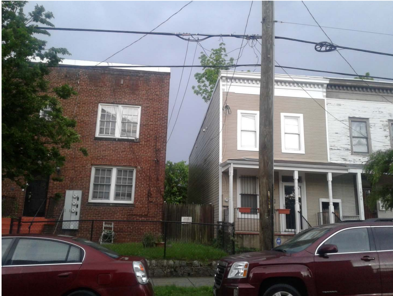
Analysis of Side Yards 1900 Block 15th Street and U Street SE by Dorcas Agyei, May 2018