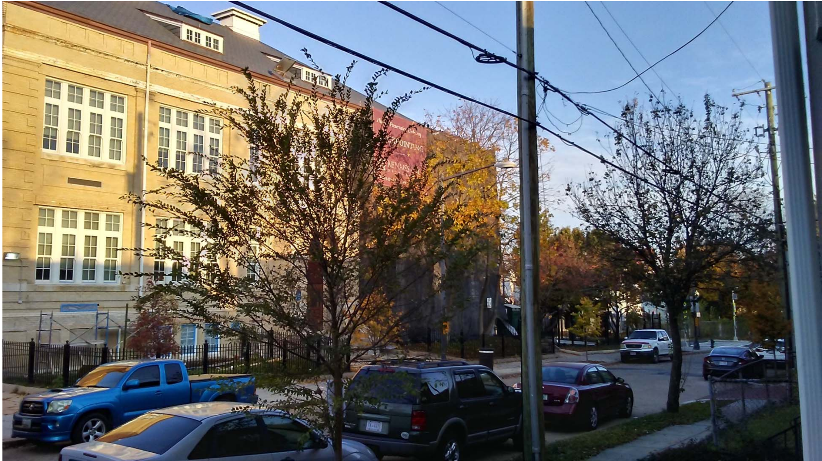
Analysis of Side Yards 1900 Block 15th Street and U Street SE by Dorcas Agyei, May 2018