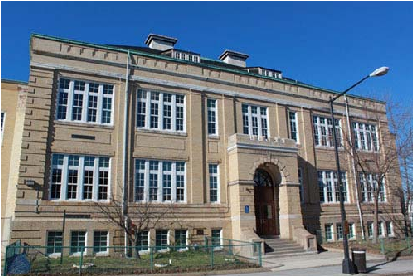
Analysis of Side Yards 1900 Block 15th Street and U Street SE by Dorcas Agyei, May 2018